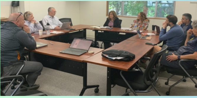
Creating Entrepreneurial Opportunity (NevCo CEO) - Planning Meeting NCERC-Sierra College-Nevada Joint Unified School District- County of Nevada-Community Members -See the story on the back page